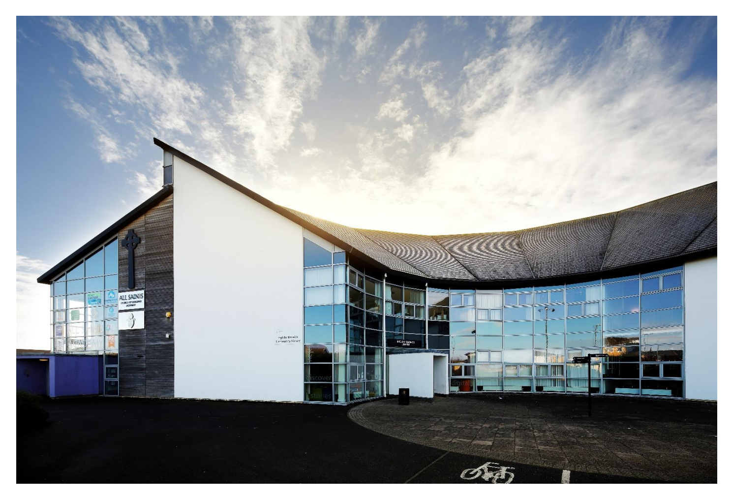
Every Child Matters Equally to God

The school converted to academy status in May 2013 and then formed the Dales Academy Trust in September 2017. The academy is oversubscribed in each of its year groups. Governors agreed to raise the admission number to 150 in September 2015 to meet the demand for more places in the school. This has been revised further to allow for expansion to a net capacity of 900, commencing September 2019.