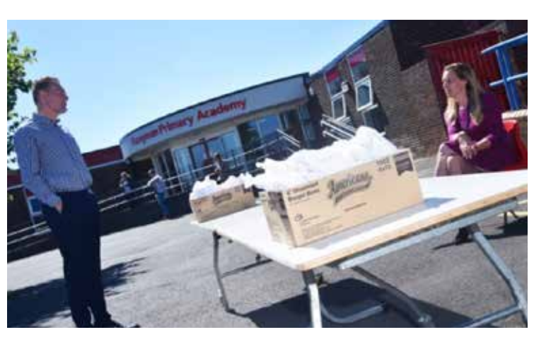
Packed lunches await pupils returning to Pennyman Primary Academy